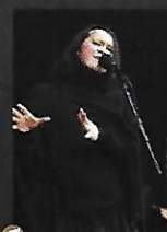
British singer and composer ANOHNi shares the 2016 Best Music, Original Song Oscar nomination for the song "Manta Ray" from Roaming featuring, for which she wrote the lyrics.