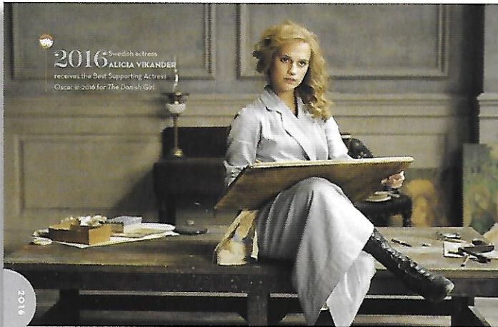
2016 Swedish actress ALICIA VIKANDER receives the Best Supporting Actress Oscar in 2016 for The Danish Girl .